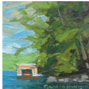
Protected Bay, Muskoka, Ontario, 8x8, $525