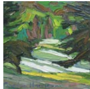
Still Passage, Deerhurst, Ontario, 8x8, $525