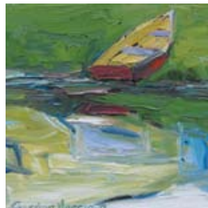
Resting, Lake of Bays, 10x10, $600