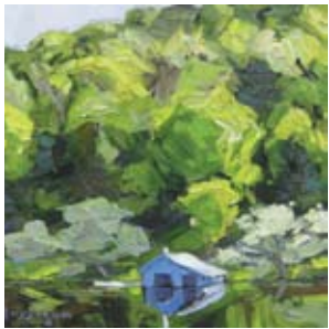
Little Purple Boathouse, Muskoka, Ontario, 11x14, $750