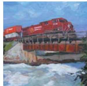
Muskoka Northbound, 40x48, Bala, Muskoka Region, Ontario, $5000