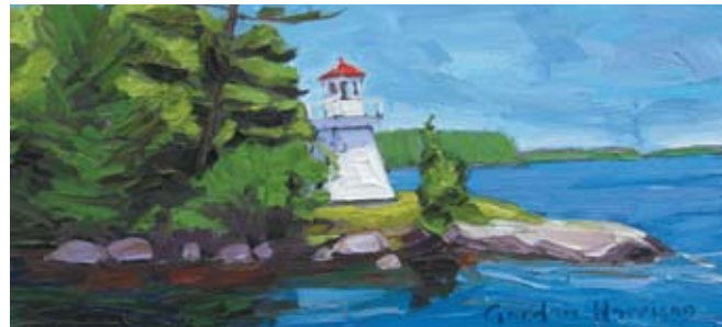
Lighthouse Watch 1, Lake Muskoka, Ontario, 10x20, $875