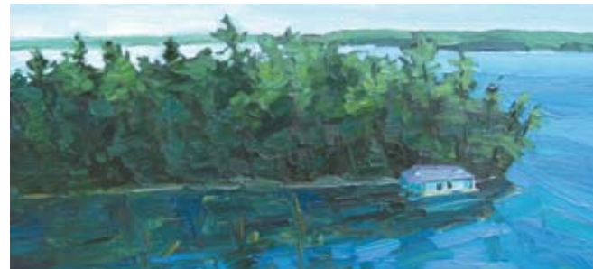
Blue Overview, Lake Rosseau, Ontario, 10x20, $875