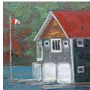
Canada's Muskoka, Muskoka, Ontario, 16x20, $1100