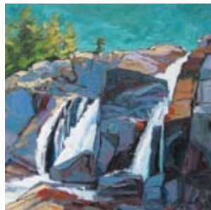
Earling Morning Cascade, High Falls, Muskoka, Ontario, 30x30, $3200