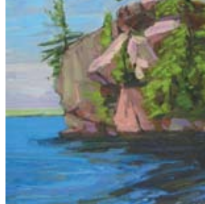
Keeping Watch, Lake Rosseau, Ontario, 36x24, $3200