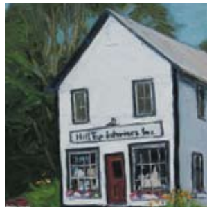
Hilltop Interiors, Rosseau, Ontario 20x16, $1100