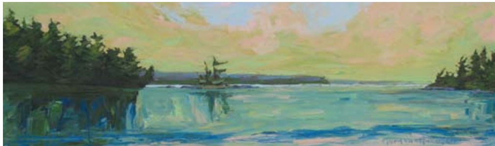
Muskoka Reflection, Muskoka, Ontario, 16x48, $2700