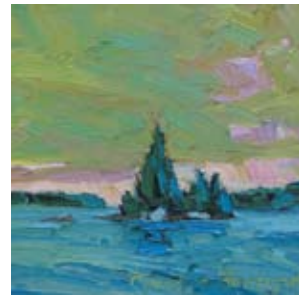
Copper Sunset, Lake Muskoka, Ontario, 8x8, $525