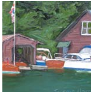
Muskoka Heritage, Muskoka, Ontario, 14x18, $1100