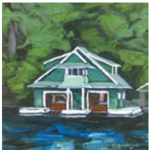
Lake Muskoka Boathouse, Lake Muskoka, Ontario, 16x12, $775