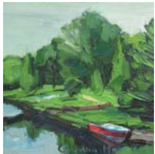
Little Red Boat, 8X8, Muskoka, Ontario, $525