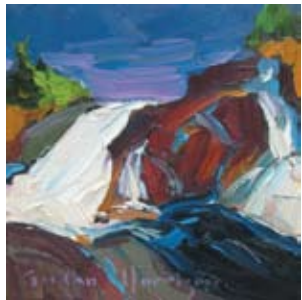
High Falls Study, Muskoka, Ontario, 8x8 , $525