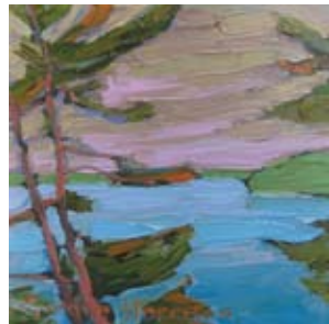
Twilight, Lake Joseph, Muskoka, Ontario, 8x8, $525