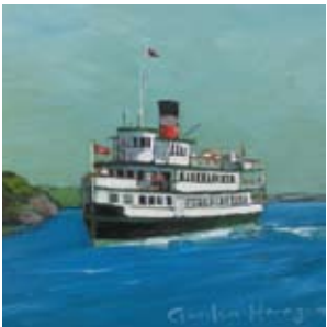
Winona En Route, Lake Muskoka, Ontario 14x18, $1100