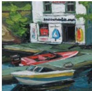
Save Bala Falls, Bala, Ontario, 14x11, $750