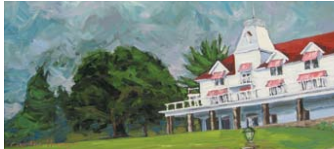
Muskoka's Camelot, Windermere House, Muskoka, Ontario, 20x40, $3200