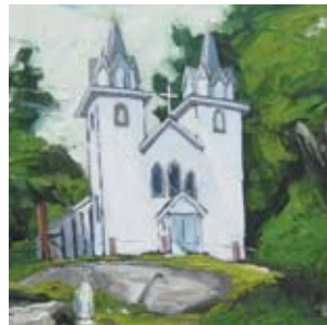
St. John the Baptist, Lake Rosseau, Ontario, 40x20, $3200