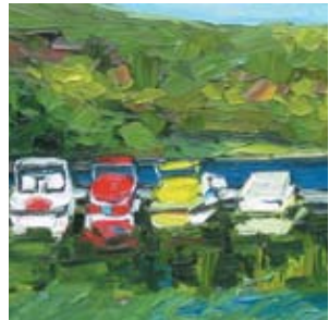
Sunset Bay at Deerhurst, Deerhurst, Ontario, 12x48, $2200