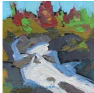
Ragged Falls Study, Algonquin Park, Ontario, 8x8, $525