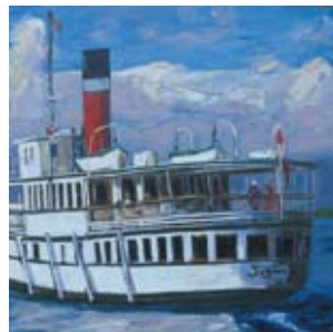
Shimmering Lake Tour, Muskoka Lakes, Ontario, 32x40, $4000