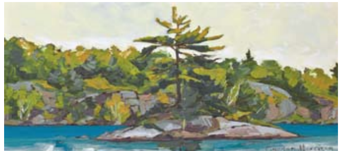
Muskoka Lakes 4, Lake Muldrew, Muskoka, Ontario, 16X36, $2000