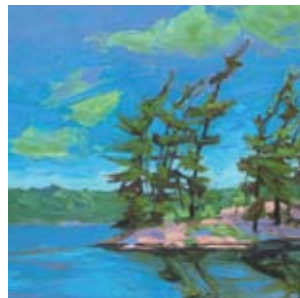
Wind Swept Summer, Lake Muskoka, Ontario, 24x24, $2200