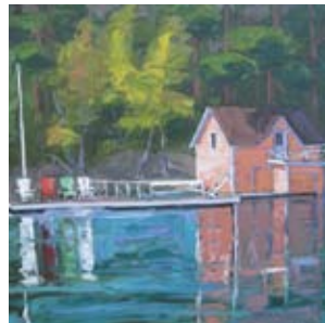
Salmon Point, Lake Rosseau, Muskoka Region, Ontario, 40x40, $5000