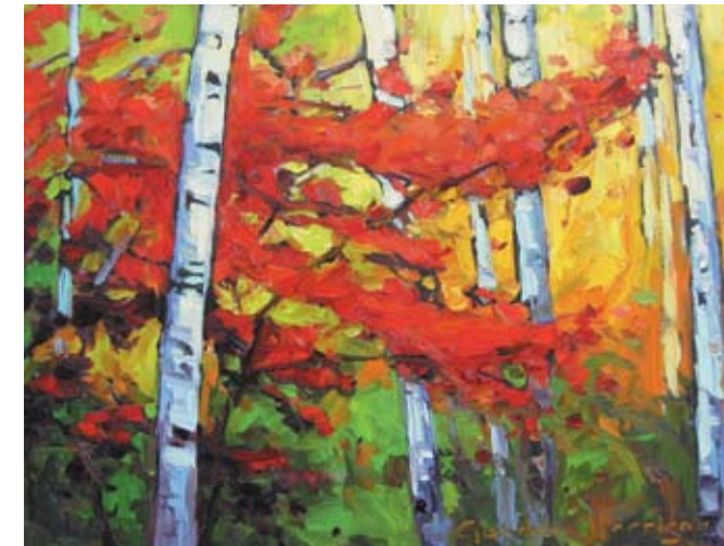
RedFallRisingCollection_7,20x24 (2), Muskoka, 20X24, $1750 Laurentian Summerlands 3, Laurentians, Québec, 36X6, $950