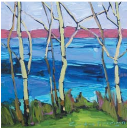
Lake Superior Aspen, North of Lake Superior, 14X14, $825

"A passion for the beauty Canada offers in its forested landscapes, rocky shorelines, sweeping valleys and enchanting communities."