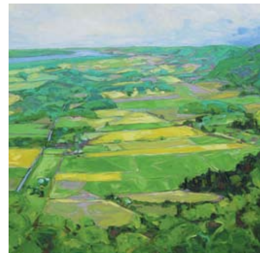
Bird's-Eye View, Gatineau Park, Québec, 48X48, $5500