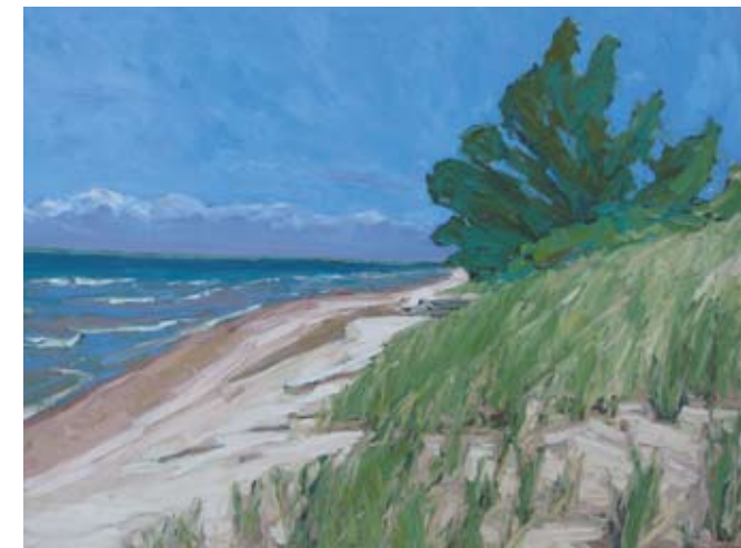
Sandbanks Beach, Lake Ontario, 32X40, $4000