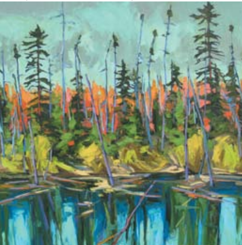
Algonquin Summerlands, Algonquin Park, 48X48, $5500