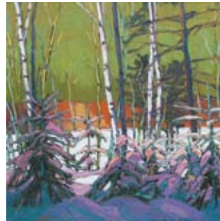
Carnival 2, L'Outaouais, Québec, 48x48, $5500