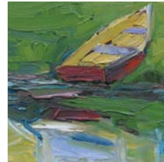
Resting, Lake of Bays, Muskoka, Ontario, 10x10, $600