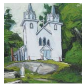
St. John Baptist Church, Lake Rosseau, Muskoka, Ontario, 40X20, $3200