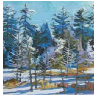
Icicle Land, Gatineau Park, Québec, 36x36, $4100