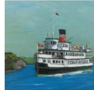
Winona En Route, Lake Muskoka, Ontario 14x18, $1100