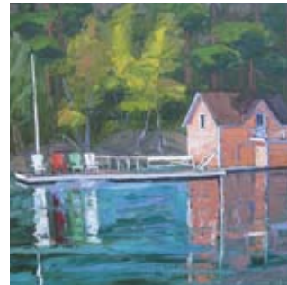
Salmon Point, Lake Rosseau, Muskoka Region, Ontario, 40X48, $5000