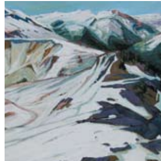
High Note Trail, Whistler, British Columbia, 36x48, $4200