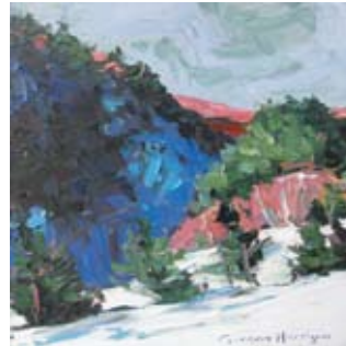
Winter Glen, Les collines de l'Outaouais, Québec, 20x20, $1500