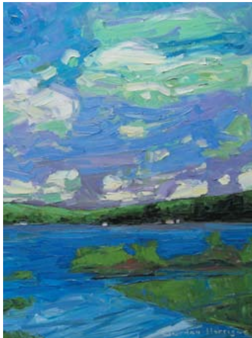
Lake Joseph Sky, Lake Joseph, Muskoka, Ontario, 36X48, $5000