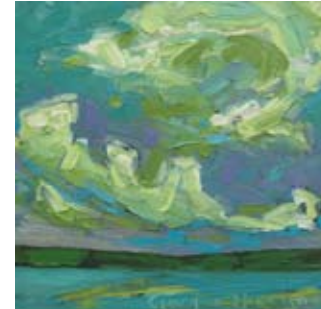
Lake Rosseau Sky Study, Muskoka, Ontario, 8x8, $525