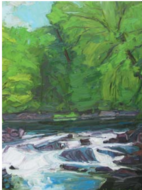
Bent River Falls, Rosseau, Muskoka, Ontario, 32X40, $4000