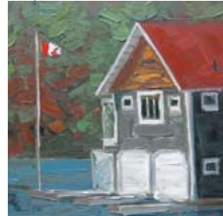
Canada's Muskoka, Muskoka, Ontario, 16x20, $1100