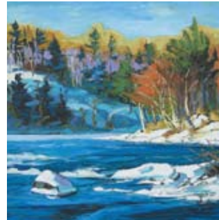
Gatineau Running, Les collines de l'Outaouais, Québec, 36x36, $4100