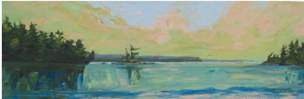
Muskoka Reflection, Muskoka, Ontario, 16x48, $2700