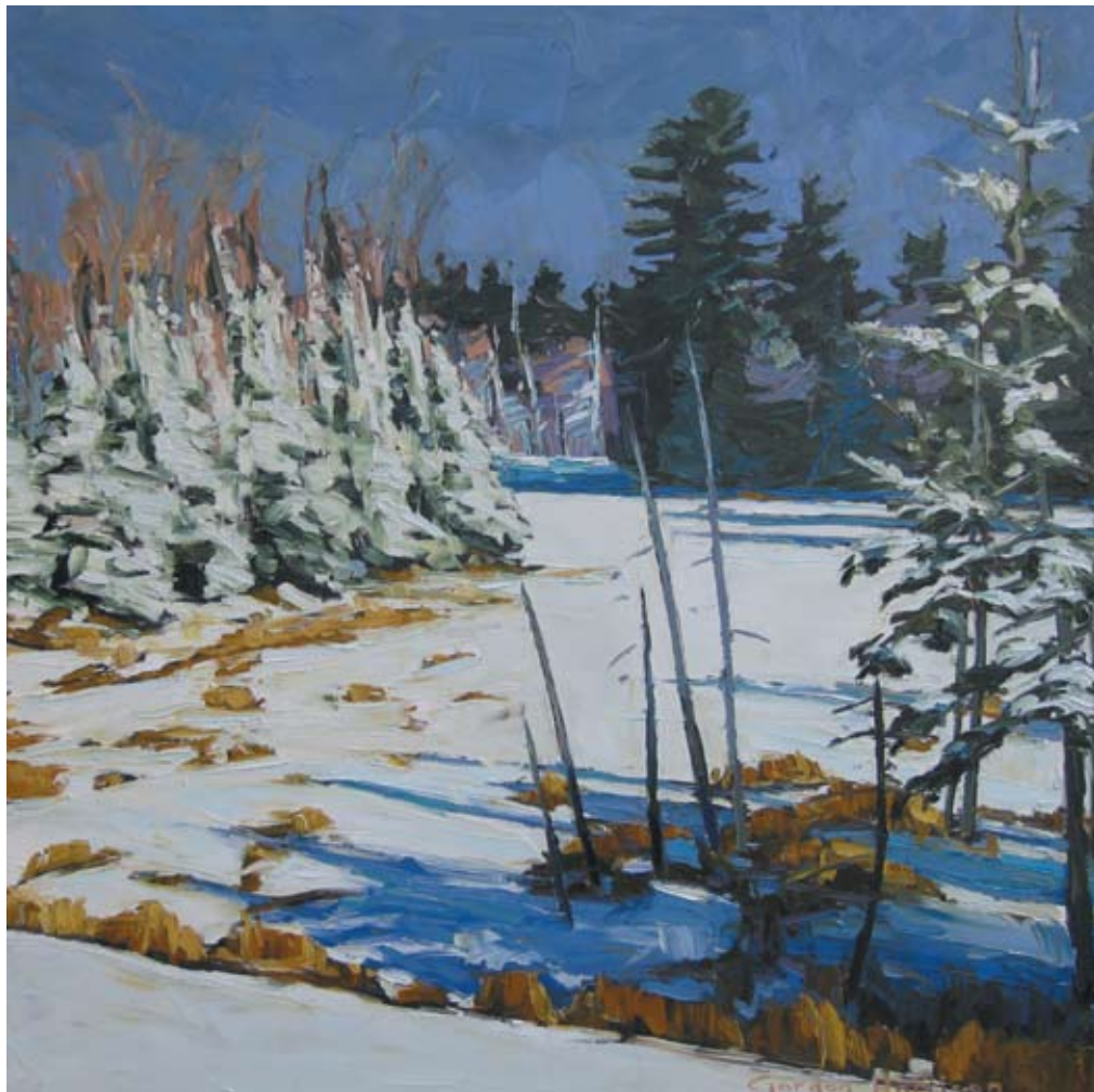
Bright Sunny Day, Gatineau Park, Québec, 48x48, $5500