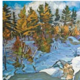
Muskoka Run, Muskoka, Ontario, 36x48, $5000