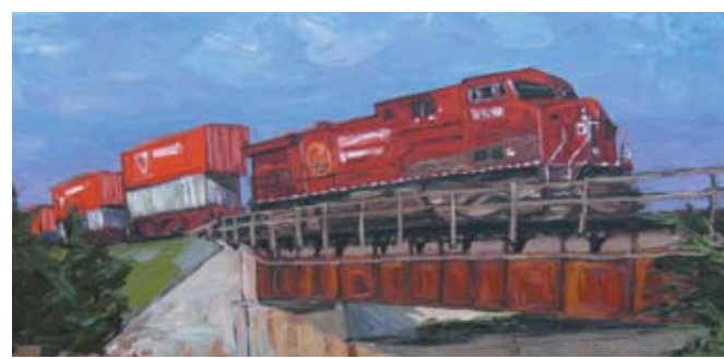
Muskoka Northbound, 40X48, Muskoka, Ontario, $5000