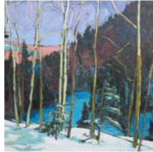
Hidden Valley, Laurentians, Québec, 48x48, $5500