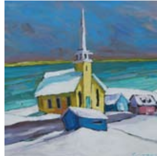
Nestled High, Charlevoix, Québec, 24x30, $2600