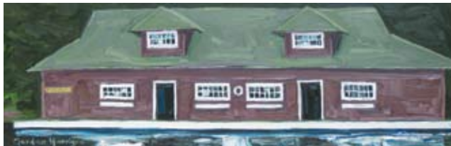
Cheynemac, Lake Muskoka, Ontario, 12X36, $1650

2311 Bloor Street W Toronto 416.763.2224