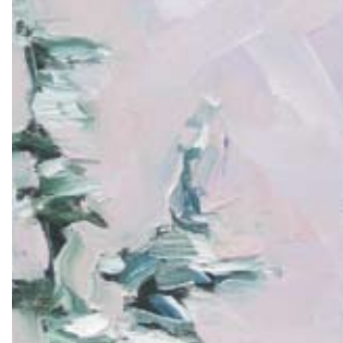
Mountain Top, Whistler, British Columbia, 48x6, $1100